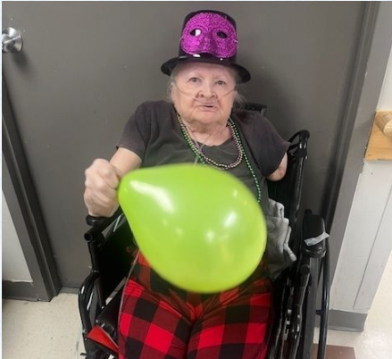
Celebrating our St. Patrick's Day festivities and parade.