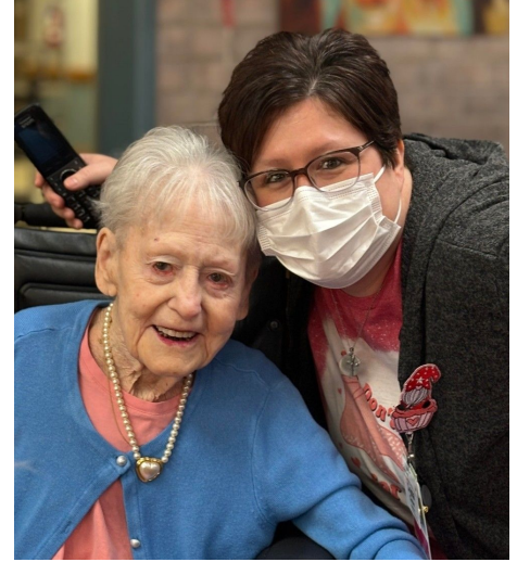
2 beautiful Valentine ladies!