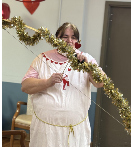
It was such a special Valentine's Day this year that Cupid even made an appearance