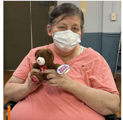
Minute to Win It Winner