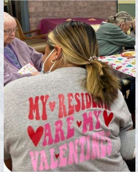
Now this is a great Valentine Shirt!!!!