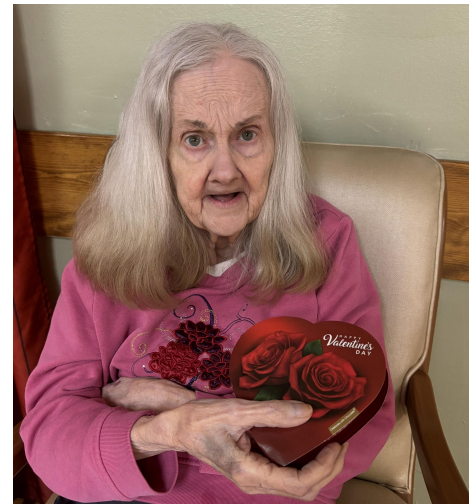
Chocolates for a Valentine Sweetheart