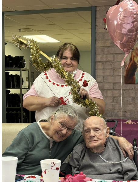
Such a special couple, Cupid's arrow found them twice!