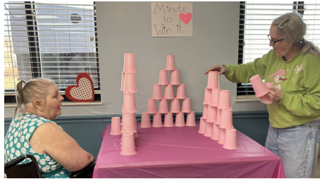
Making a pyramid game