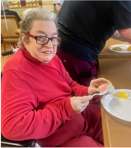
Best part about baking and icing cookies is getting to eat them!