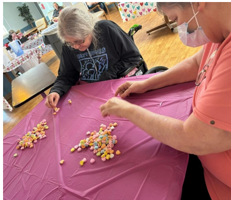
Minute to Win It game