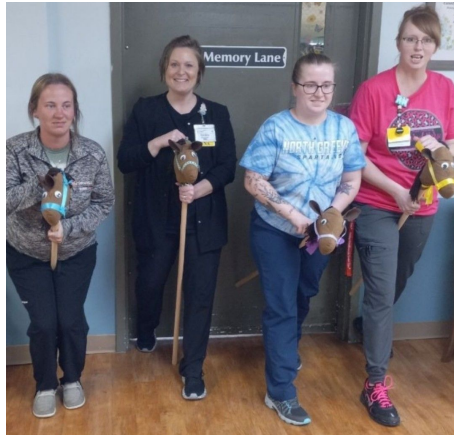
And the Kentucky Derby Race is on!

It was the first time we created our own Kentucky Derby here at WHNR. The ladies gathered and made hats to sport at the races. Thanks to the staff that hopped aboard the horses and gave a good show!