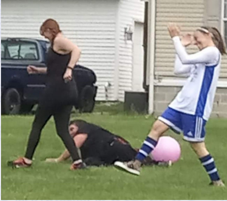
It was a wild, but fun, kickball game!