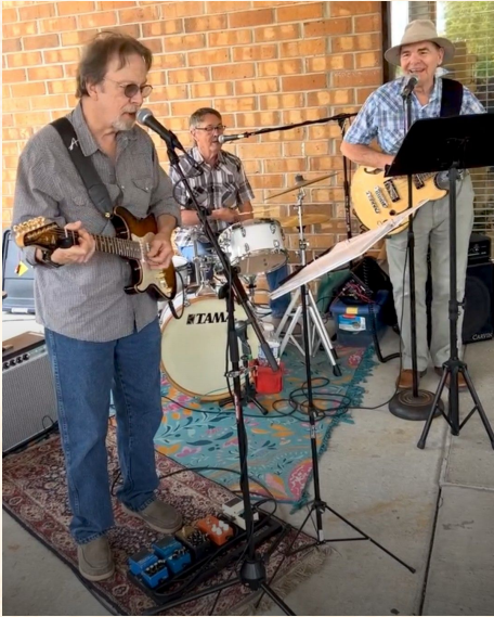
Band Left Hand Cowboy from Bethalto