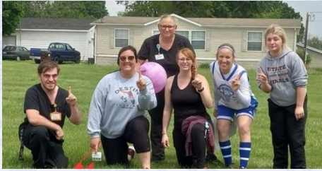
The Winning Kickball Team