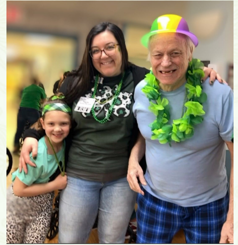
These three look to be mischievous Leprechauns!