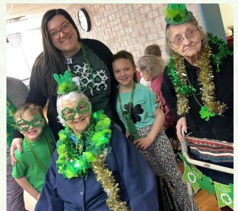
The end of the parade route! Time to party!